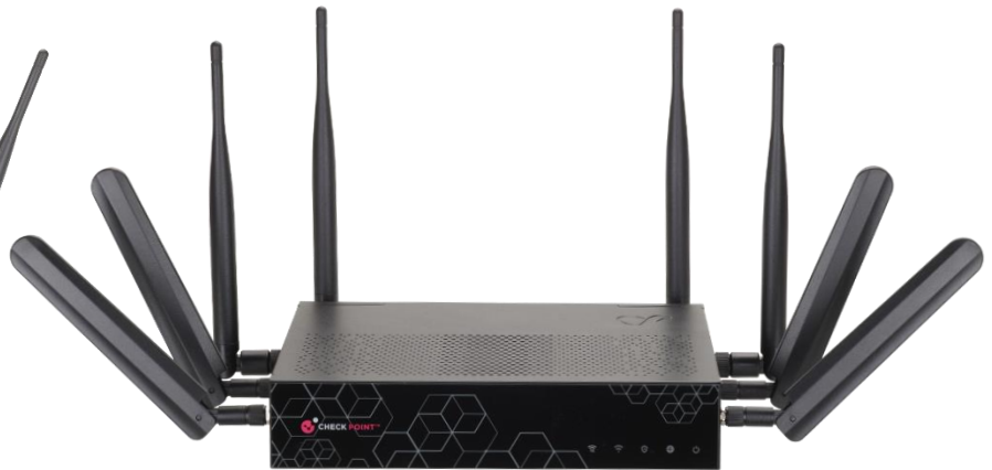
1595 Pro Wi-Fi 5G