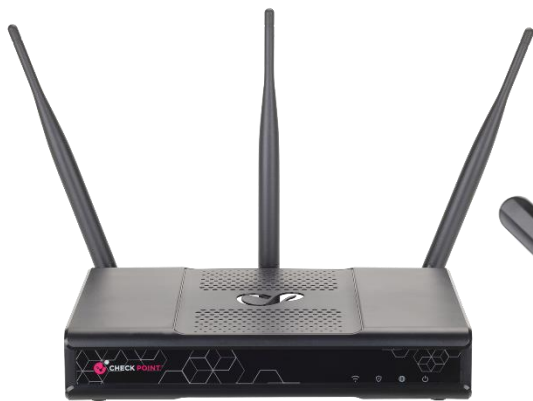
1535 and 1555 Pro Wi-Fi